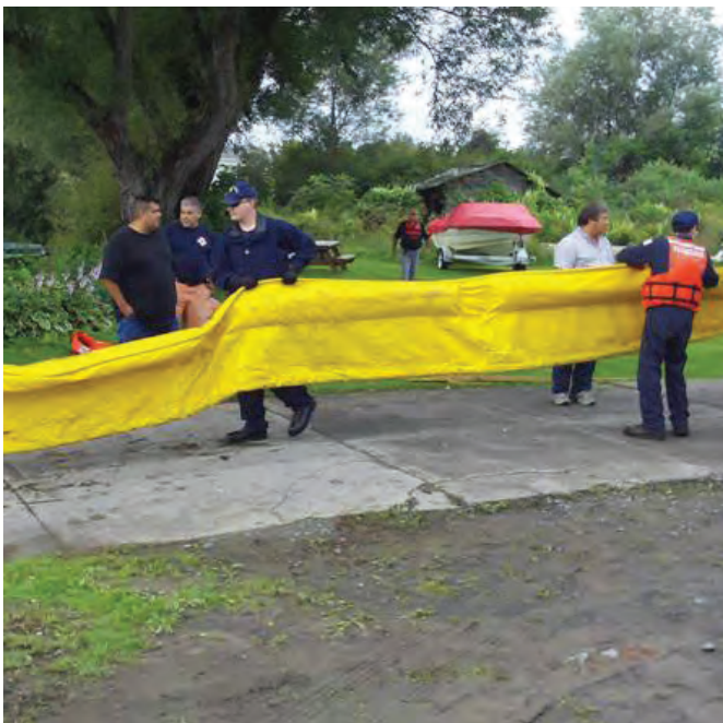
Preparing boom deployment for the mock drill.

The exercise was a complete success and provided the opportunity to assess local response plans, identify resource needs, and discuss ways to improve response capabilities. ■■■