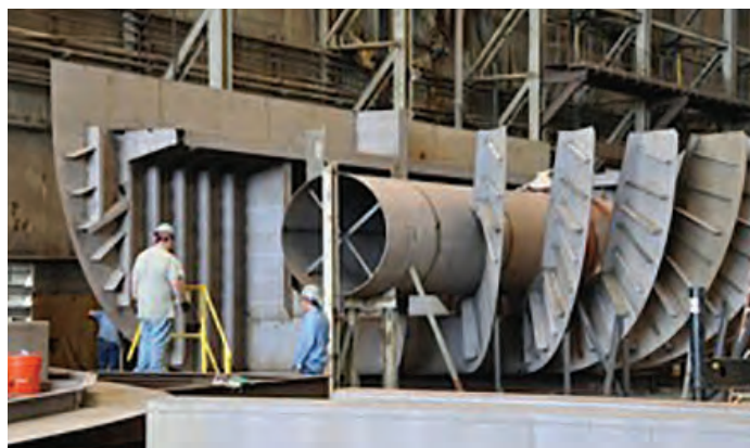
Shipbuilding at Donjon Shipbuilding and Repair in Erie, Pennsylvania.

One of the best known shipyards in the Lakes is Bay Shipbuilding Co. (BSC) in Sturgeon Bay, Wisconsin. Owned by Fincantieri