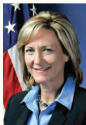
Betty Sutton Administrator

I became Administrator of the Saint Lawrence Seaway Development Corporation (SLSDC) in August, 2013. It's been a busy year for me as I have traveled the length of the Great Lakes St. Lawrence Seaway System;