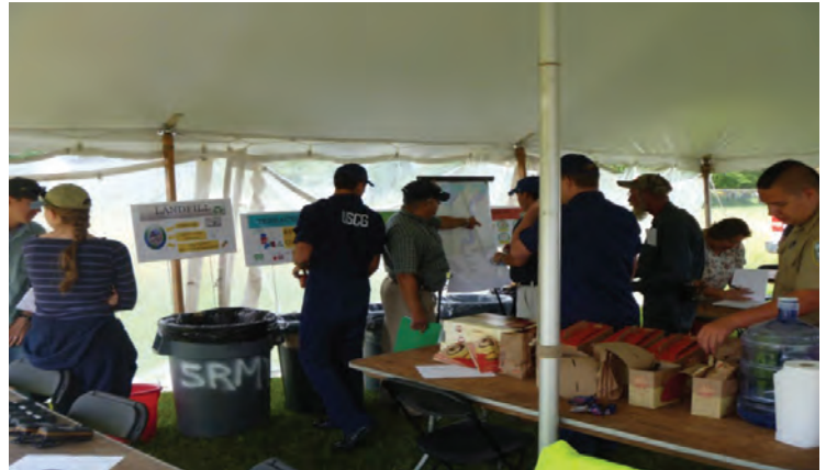
Participants gather for the Boom Exercise.

The event began with a roundtable discussion of resources in the area between the reservation, U.S. Coast Guard, and the SLSDC. Also discussed were first responder actions, cleanup, and diversion of spills. After the roundtable discussion, a mock drill of a spill on the river was conducted. A boom deployment took place to simulate the diversion of the spill away from a marsh area and fish habitat.