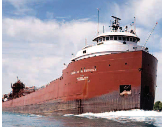
The Charles M. Beeghly soon to be named the Oberstar.

The laker had previously been named the M/V Charles M. Beeghly , after the former Chairman of the Board of