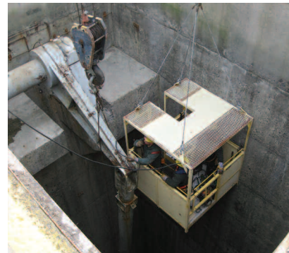
Preparing to remove the valve stem.

the U.S.-operated locks, the navigation channels, the Seaway International Bridge, and other SLSDC facilities in Massena, N.Y.