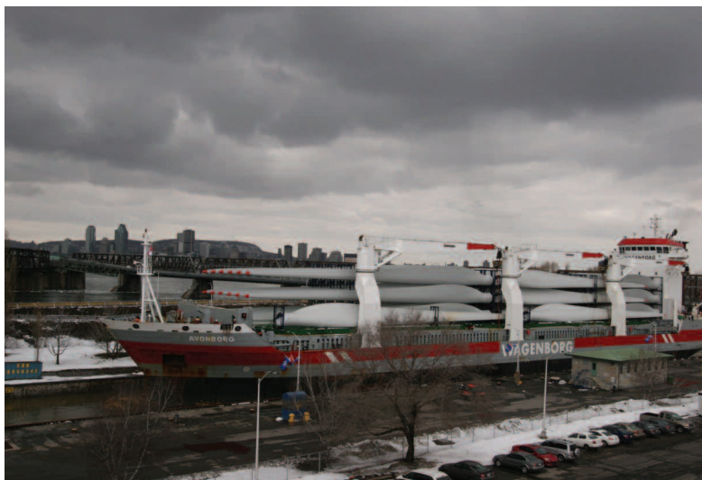
The Avonborg carries wind turbine components bound for Indiana through the St. Lambert Lock.

The Avonborg had closed out the waterway's 2010 season and its arrival as first ship entering the Seaway for the new season served as the impressive backdrop for the annual opening ceremony at the first of seven Canadian and U.S. locks permitting vessels to enter Lake Ontario. The upbound ship entered Snell Lock the following day at 9:35 a.m., officially kicking off the U.S. Seaway's season. Headed to Burns Harbor, Indiana, the ship's cargo will be offloaded and trucked to a wind farm in Payne, Ohio, near Ft. Wayne.