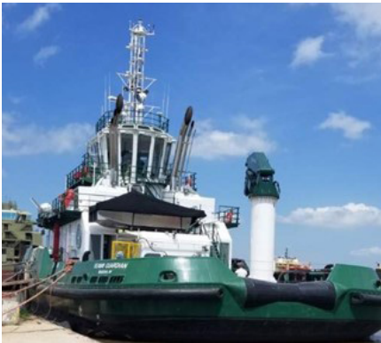
Seaway Guardian stern

Construction on the Seaway Guardian is 99 percent complete as all owner dock trials have been approved. The vessel continues to undergo minor fit and finish work to both the interior and exterior.