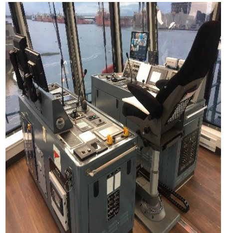
Pilot House Console

The vessel will be drydocked for a final hull cleaning and prepared for towing to Port Fourchon, LA for sea trials in the Gulf of Mexico. Bollard Pull trials will follow in Pascagoula, Miss. with the delivery voyage. Finally, the vessel will travel up the Eastern Coast of the United States and into the St. Lawrence River to Massena, N.Y. with a final handover of the vessel to the SLSDC in July. ■ ■ ■