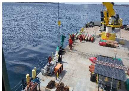
Preparing to commission LB 211 while being overtaken by CCG vessel

This year's buoy run had its challenges due to the exceptionally high water levels throughout the Great Lakes. Because of the high water levels, the flow rate had to be increased to bring the levels down, and in doing so, it created operating challenges for the SLSDC's Robinson Bay . The flow rate below the Snell Lock exceeded the Robinson Bay 's capabilities, so the Canadian