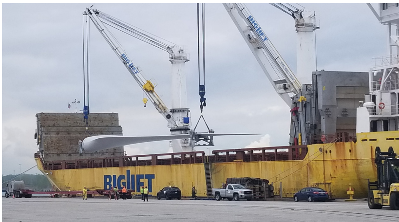
Wind blades at Port of Indiana-Burns Harbor

The 2020 Saint Lawrence Seaway navigation season has begun, and despite some unforeseen challenges, there have been some positive cargo movements throughout the Great Lakes Seaway System. Overall through May 31, the Seaway has posted a total of 7.7 million metric tons (mmt) of cargo through the Seaway, a 10.22 percent decrease over the previous year. Even with this decline, there are some key cargo segments exceeding or maintaining their pace of last season. The key cargo performer this season is in the general cargo sector where there has been a 3.5 percent gain in year-over-year shipments. This increase is being driven by the number of ships hauling wind energy components and steel slabs to both U.S. and Canadian ports.